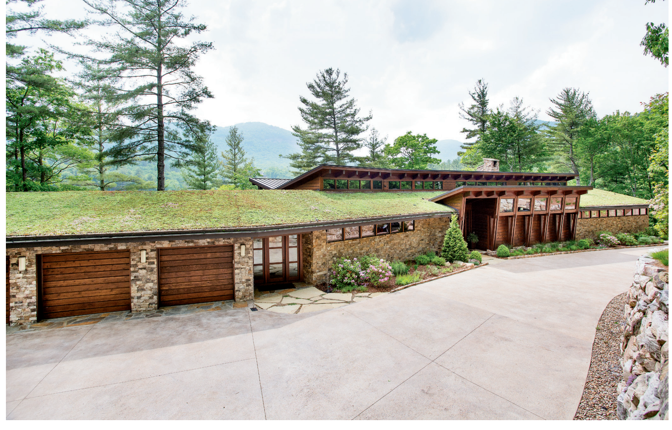
ONE WITH NATURE While the home's contemporary design is uncommon in Lake Toxaway, natural elements including a stone and Douglas fir exterior and living roof help it blend with the environment. Below, the Zanders on their back deck

hen the team from Platt home gains its footage in height. Approach Architecture in Brevard it from the pavement, and the dwelling drew up the plans for looks like a modest single-story residence Jeff and Elisha Zander's with the stone and Douglas fir exterior and attractive living roof blending nicely with home on Cardinal Lake in the small Lake Toxthe surroundings. Approach it from the away community, they must have thought of water, which is not likely given that it's a the photographer's rule of thirds. A soaring private lake, and the home's grandeur is pitched roof and multiple floor-to-ceiling apparent.